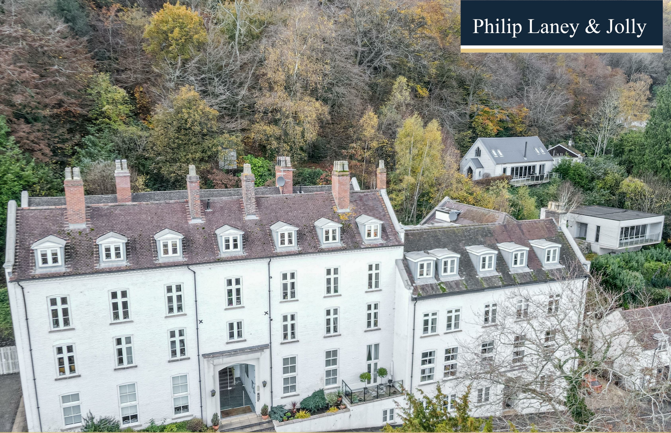
The Penthouse, Wells House, Malvern Wells Offers Based On £375,000